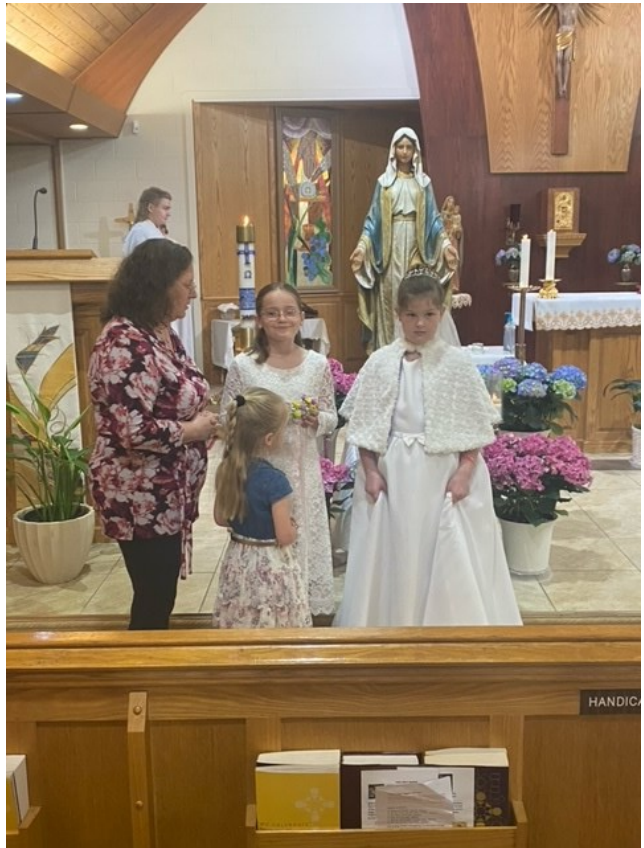
****Mass every Wednesday at 6:00 p.m.

Thank you to all those who took part in the May crowning of the Blessed Mother this weekend! May is the month of Mary so we ask her to intercede for us.