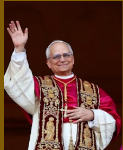
POPE LEO XIV ROBERT FRANCIS PREVOST