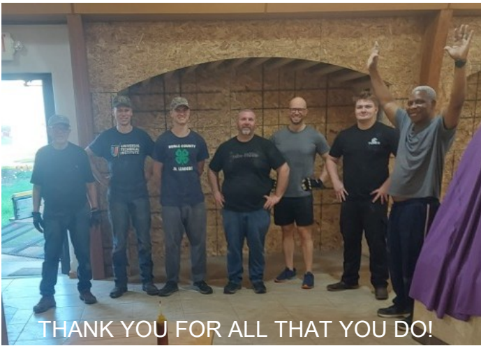
THANK YOU FOR ALL THAT YOU DO!

All of your volunteer work is greatly appreciated! We are so thankful for the volunteers who are spending countless hours working to complete the renovation at St. Gaspar Del Bufalo!